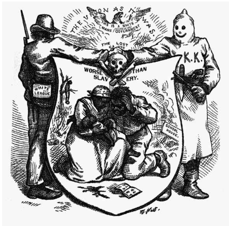
A cartoon from an American magazine published in 1874. The cartoon is called 'Worse than Slavery'.